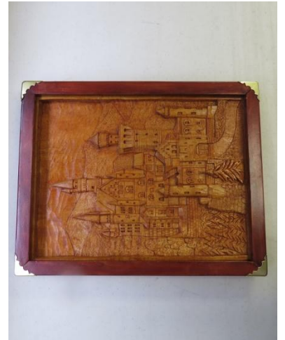
These previous relief carvings from Vince for the Lancaster show